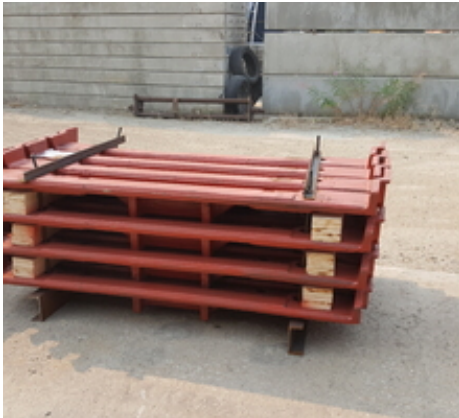
Apron Feeder Pans