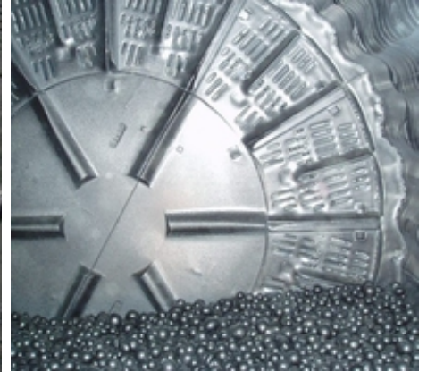
Ball Mill Grates