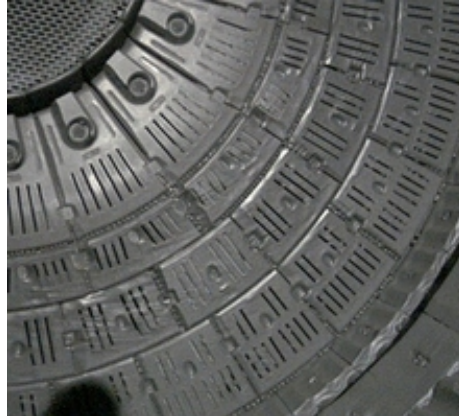
Ball Mill Discharge