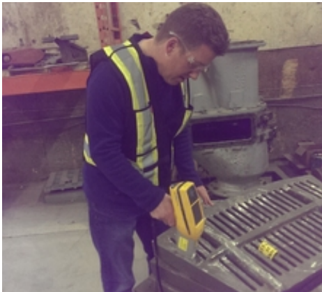
Ball Mill Grates