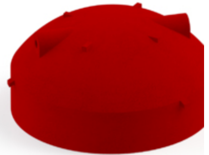
Gyratory Spider Cap